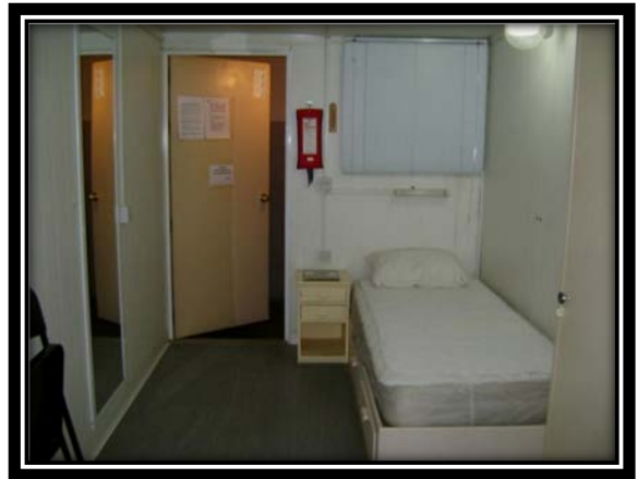
Example of a Shared CHU