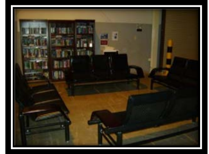
Examples of a Shower Stalls, a Hallway of CHUs, and a Common Area