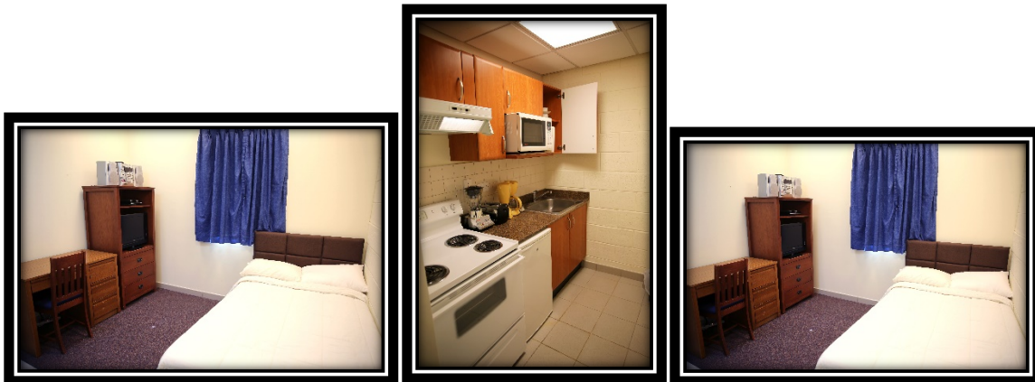
Photos of Senior Leader Quarters Unaccompanied Housing Two Individual Rooms One Bathroom and Kitchenette