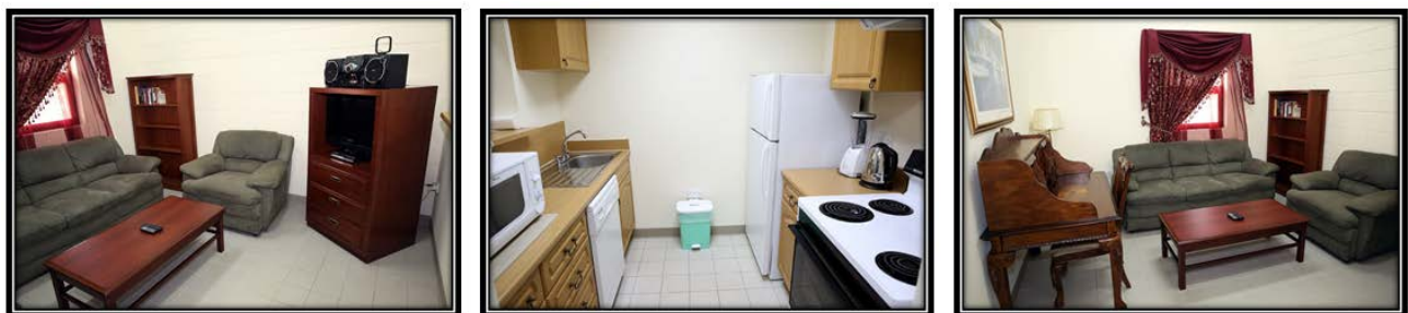
Photos of Senior Leader Quarters Unaccompanied Housing. One Individual Room, One Living Room, Bathroom, and Kitchen.